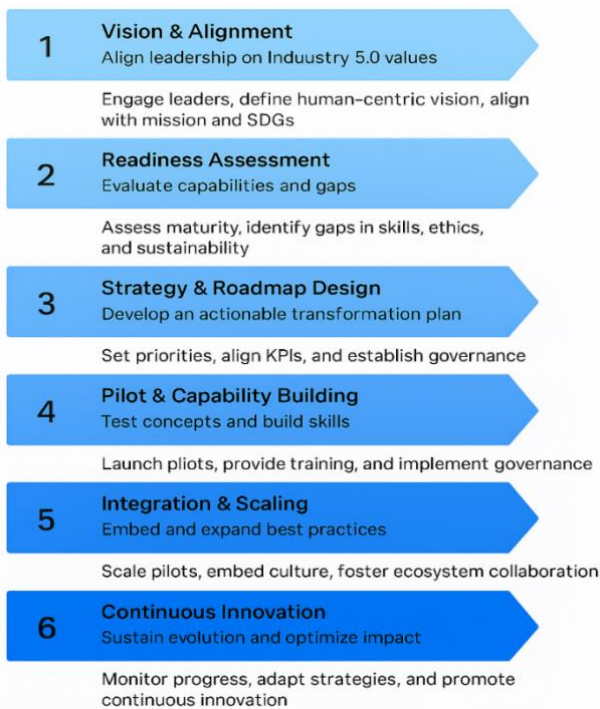
Fig. 3 Phased implementation roadmap for Industry 5.0